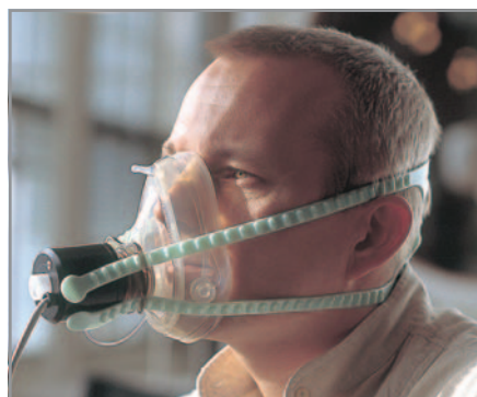
Besides the standard manometer probe two silicone masks are also included with the RhinoStream module.

The standard nose adapters are tailored to fit right and left nostrils, with a pleasant, non-slip surface that is anatomically designed to offer maximum patient comfort and a perfect fit. These units can also be used with the RhinoScan module.